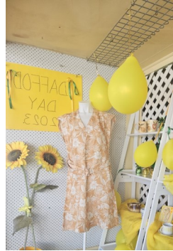
DAFFODIL DAY OP SHOP WINDOW DISPLAY