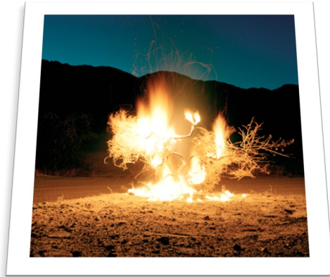
'I Am that I Am'